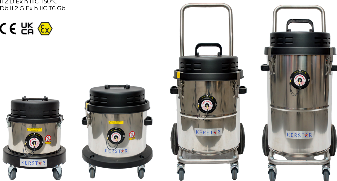
KAV 15, 20, 30 and 45